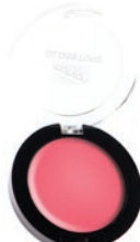
GLOSSTONE Pearl Frosted 126F