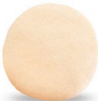
Powder Puff 123