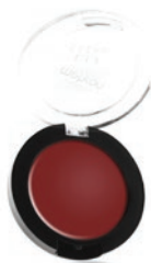
L.I.P Cream Big Apple 103N-RR