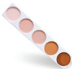
Celebré Pro-HD Cream Foundation 5-Well Tray