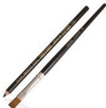
E.Y.E Liner Pencil Black 115-B & Stageline Brush 302