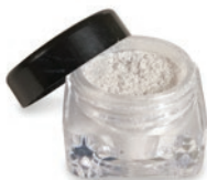
Precious Gems Diamond