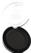
E.Y.E Powders Black 207-B & Wheat 207-NW