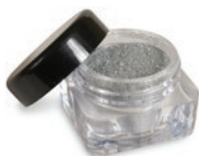
Glitter Dust Holographic Silver 127C-H